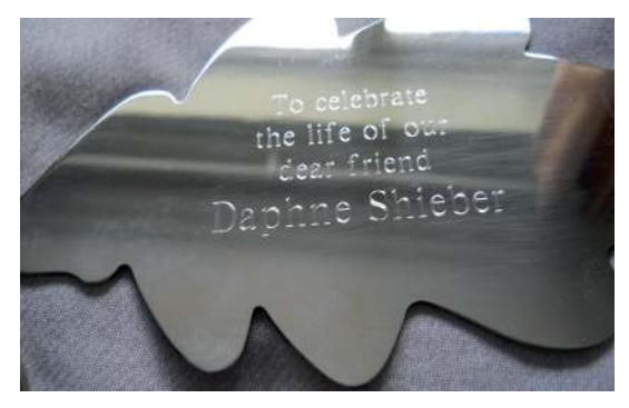
Actual engraved leaf

There will only be 50 of these leaves available, so do not delay if you think you would like one to hang forever in the Friends Sensory Garden within the Chelsea Gardens in Telford Town Park.