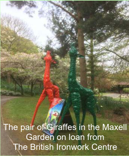
The pair of Giraffes in the Maxell Garden on loan from The British Ironwork Centre

Sinclair Gardens, Ketley just down from the Shropshire Star offices