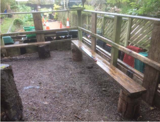
New Seating area