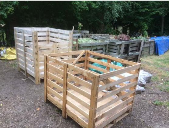
New Compost Bins