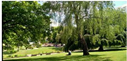
West Midlands Runner up Abbey Park, Evesham