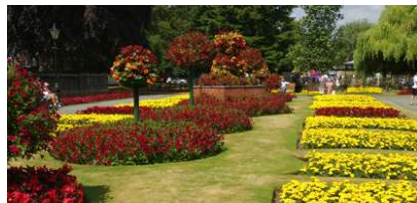
West Midlands Runner up Cae Glas Park, Oswestry