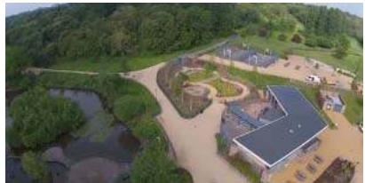
West Midlands Winner Telford Town Park