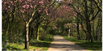
UK winner Stanley Park, Blackpool